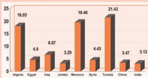
Percentage of skilled migrants in OECD countries of total skilled workers in origin countries (selected number of countries)

The number of Arab born competencies living in OECD countries exceeds the one million, around half of them are from Arab Maghreb countries, and around 60% of them have the nationality of country of residence.